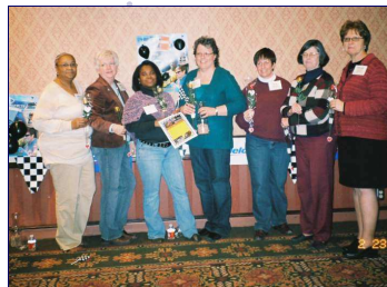
Winning Pit Crew

February 23 and 24 marked the dates for the 17 th Annual Central Area Professional Development Day, in Olathe, Kansas. KAEOP was the host for this conference and the theme was "Fast Track to Professionalism." States represented were Illinois, Kansas, Missouri, Nebraska, and one person from Pennsylvania. Approximately 50 individuals attended the conference which began with a get acquainted open house Thursday evening. Delicious snacks, mingling, and a racing word search started the activities. The participants divided into groups for "building their race car" out of office