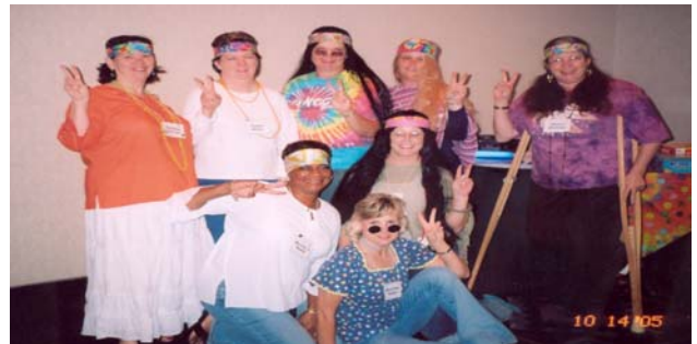
Open House Hippies