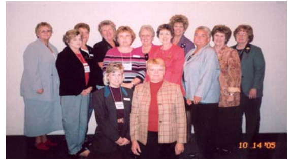
Above: KAEOP Past Presidents