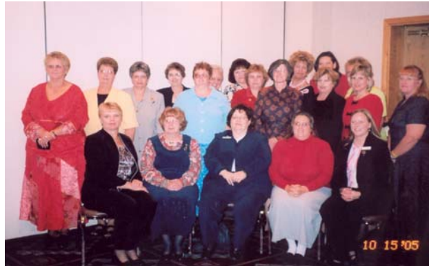
Left: 2005-2006 KAEOP Executive Board

The Country Store made $492.00 on the baskets (and a few country store items) and $60.00 on the 50/50 drawing for a total of $552.00. The winners of the baskets and the drawing are listed below: