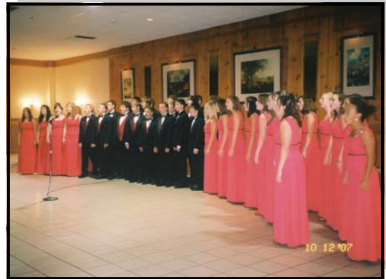
The Great Bend High School Madrigal-Pop Singers entertain at Friday's luncheon