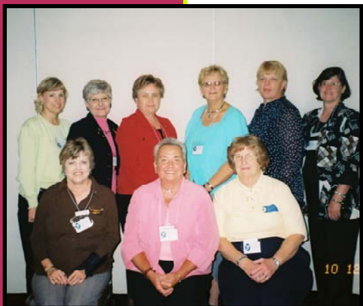
KAEOP Past Presidents gather for a picture at the 2007 Fall Conference in Great Bend

KAEOP Past Presidents held their fall meeting on October 11, 2007 following the fall conference Open House with eight members present. Communications from past presidents who could not attend were shared and the treasurer's report was given. A cheer