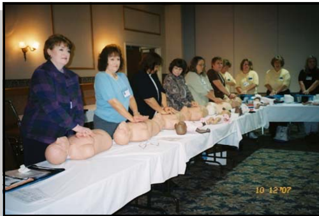
Conference participants partake in the CPR/First Aid class