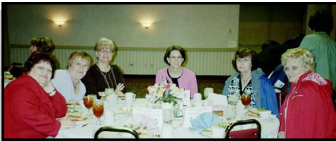
Members enjoy Friday's Luncheon